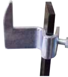
Set screw holds hook firmly in place