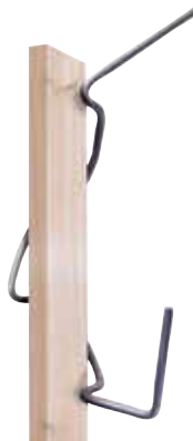
Design allows hooks to be securely affixed fits both flat and round stakes.