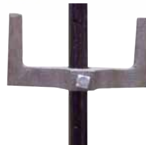
Allows two level lines to be run