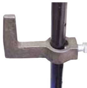
Set screw holds hook firmly in place