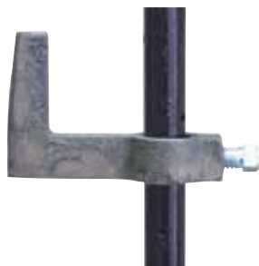
Mounts easily on round stakes