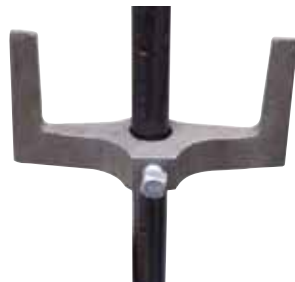
Mounts easily on round stakes