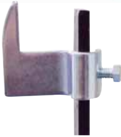
Mounts easily on flat stakes