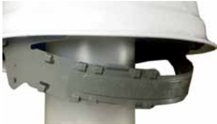
QUICK SLIDE ADJUSTMET