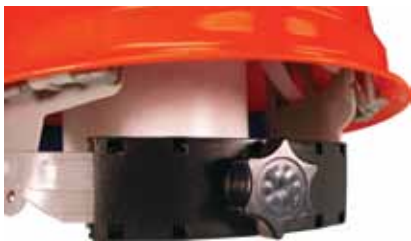
RATCHET STYLE ADJUSTMENT